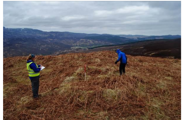
Survey in progress at Allt Mòraig (AOC)

The resulting survey at Allt Mòraig identified 27 structures, and some walling that probably restricted animal access to the nearby watercourse. The grazing areas, being well manured, have the potential to provide environmental evidence as their vegetation differs from the surrounding moorland.