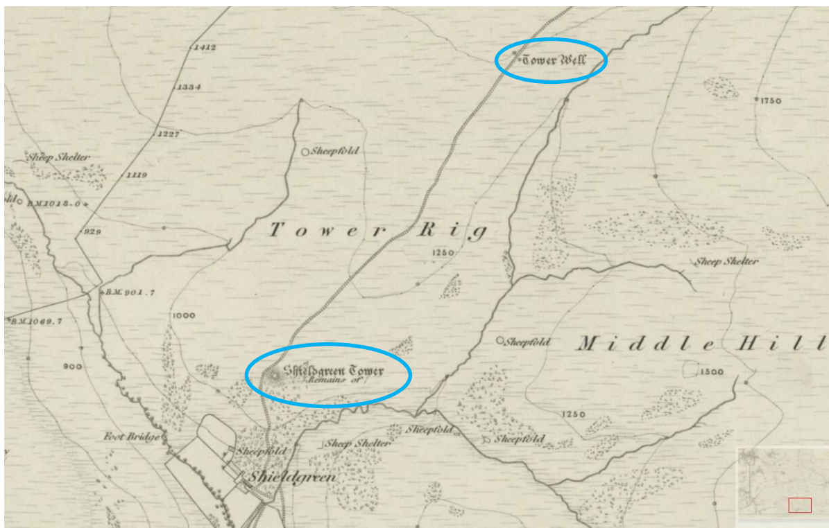
Illus 2 Extract from OS 6 inch 1 st edition map

However, I now had the approximate position and an altitude for the Shieldgreen Tower Well based on the old maps. What next? Well for a start I didn't know if the old grid squares matched up with the grid squares on modern maps. These are the squares on maps (black on old maps and blue on new maps), which are used to work out grid references. The squares, even in the newer old maps, were 1 kilometre squares, and can be used to work out a series of numbers to signify the position of objects in the grid squares. In the old days, six figure map references were used. This gave a location within a 100 metre square. These days, ten figure map references are used and this can place an object within a one metre square. All this is possible because of GPS.