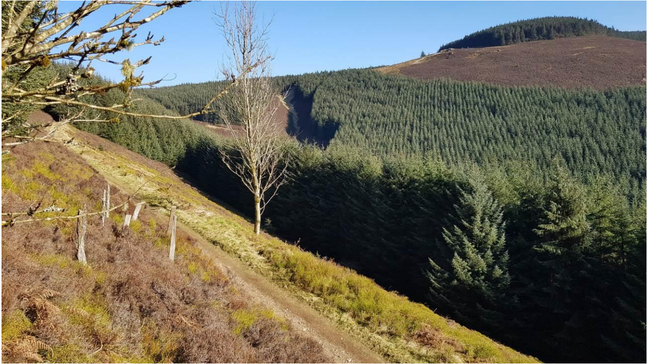
Illus 3. Looking towards presumed location of the Well

Armed with the old maps, the contour data and bearings taken off the maps from nearby peaks, I determined a position for the well: NT 27908 43939.