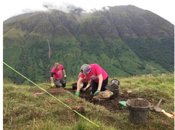
Excavations in progress at Dun Deardail vitrified fort, set in a spectacular location high above Glen Nevis