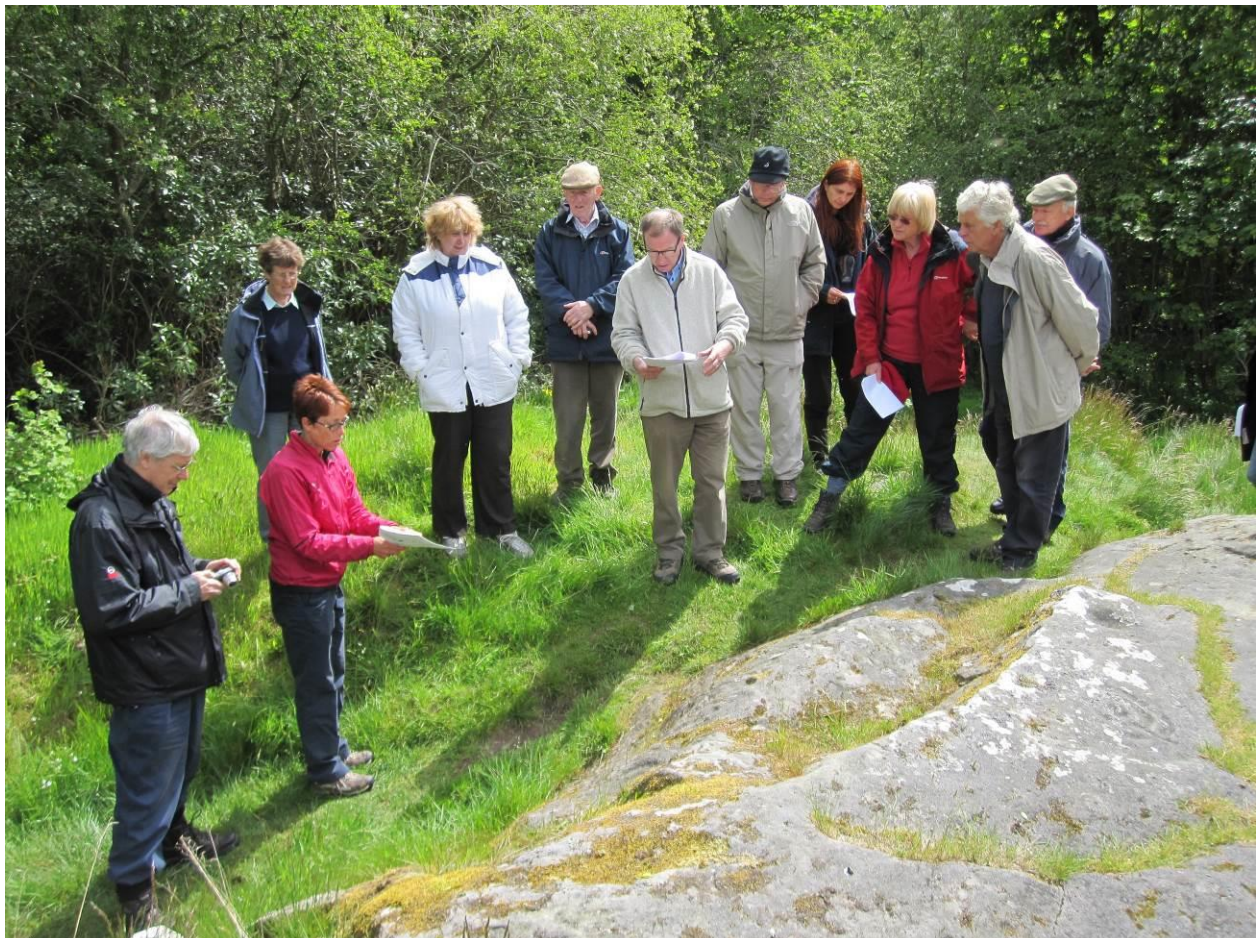
Northumberland field trip 2012. Visiting the rock panels at Roughing Lynn, near Wooler.

Other obstacles to research have included lack of resources and very variable standards of recording, often compounded by inconsistency and inaccuracy (for example, some recorded examples of rock art are now considered to be natural features). ScRAP has been designed to overcome these issues. With some eleven community teams now trained, complemented by field schools for university students, the project will revisit and verify known monuments and search for others. All sites will be digitally recorded and modelled in 3D in a consistent way, before being uploaded to CANMORE after checking by the core SCRAP team co-ordinating the work. Hundreds of records are already complete or underway, and significant new discoveries are being reported. Readers are encouraged to consult the project's attractive website – www.rockart.scot – to see how Scottish rock art is being put back on the map!