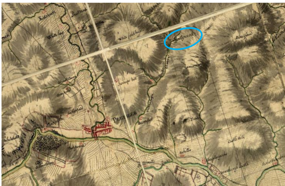
Illus 1. General Roy's Map showing Peebles area and location of Shieldgreen