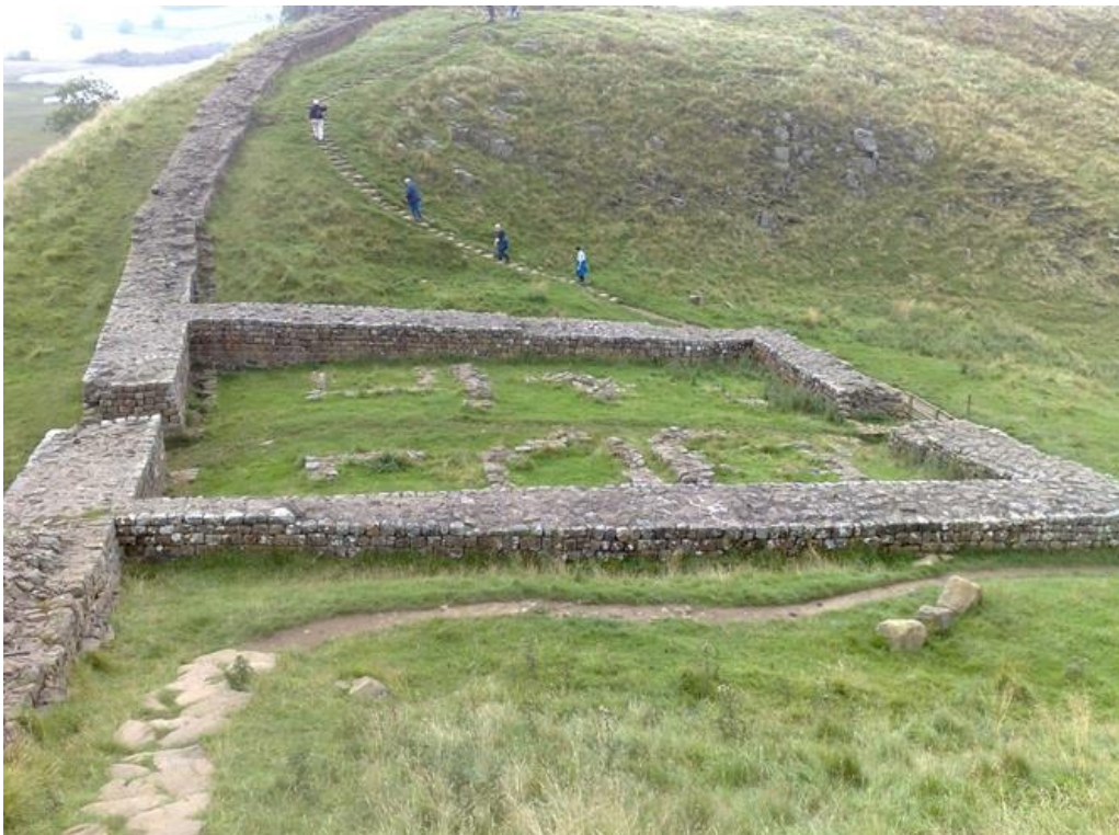
Hadrian's Wall

https://www.socantscot.org/event/rhind-lectures-2019/